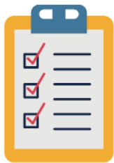
Review of State Plans